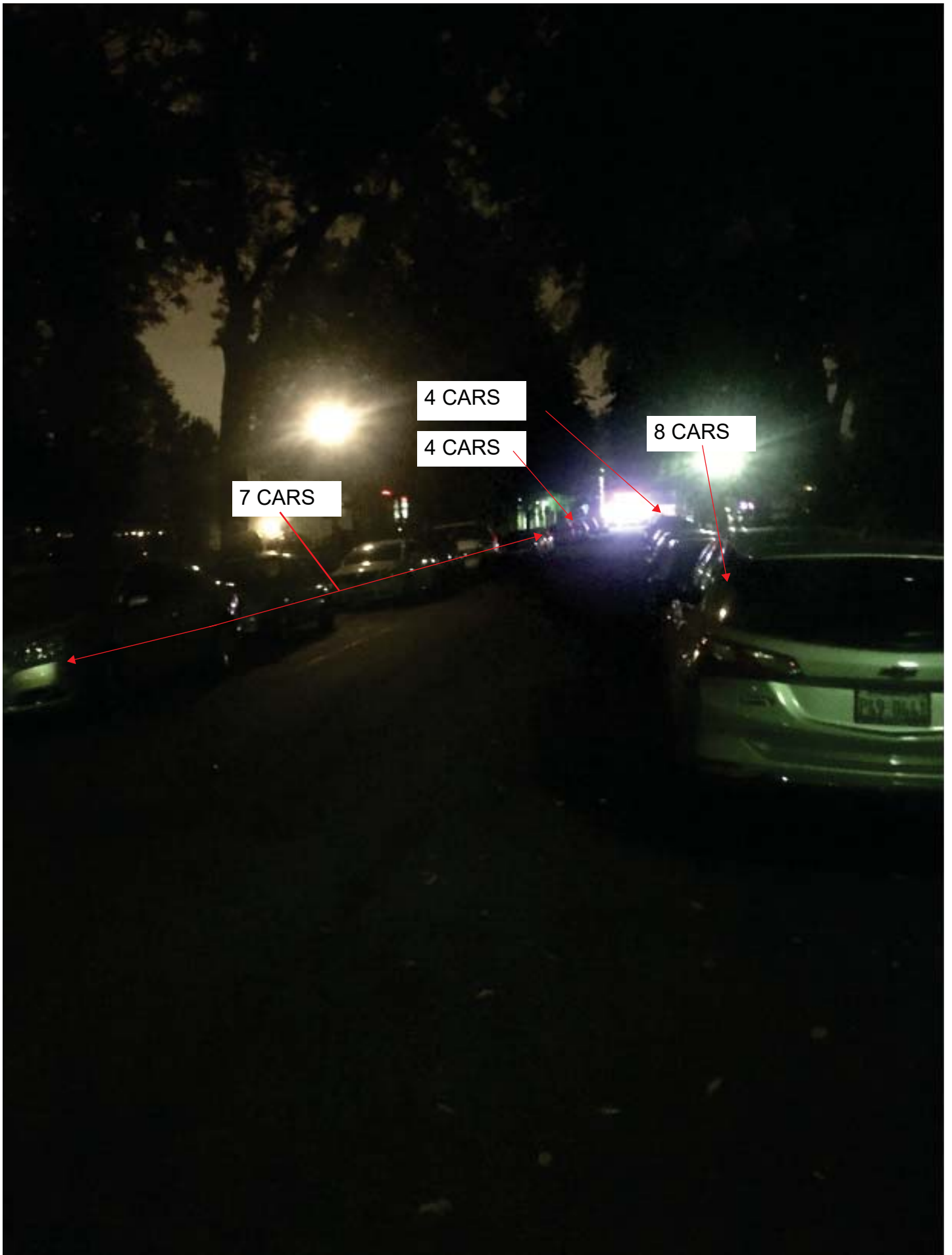
TYPICAL CARS ON FRIDAY AND SATURDAY NIGHT 23 CARS AT TIME OF PHOTO