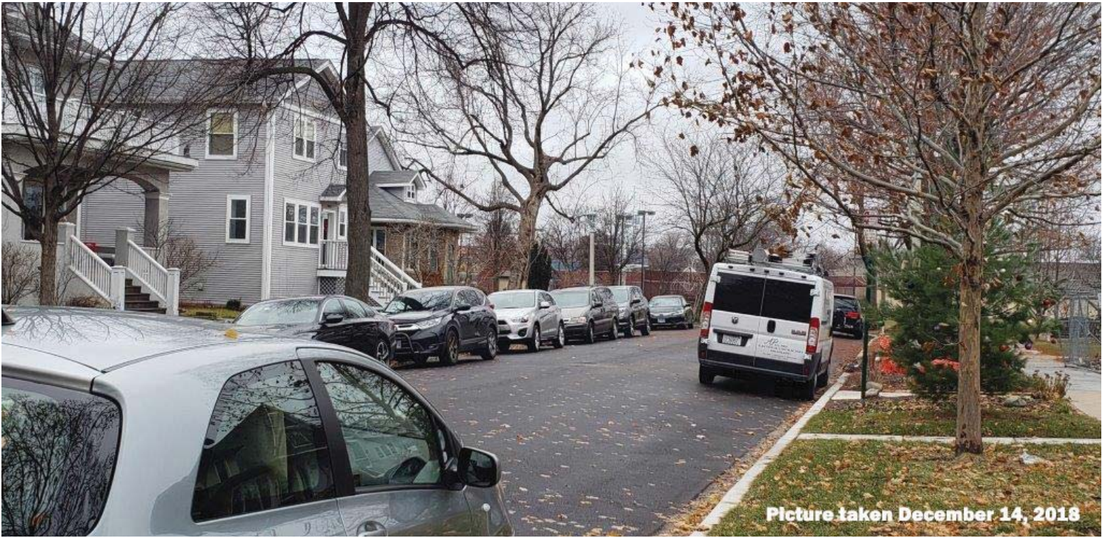
Picture taken December 14, 2018