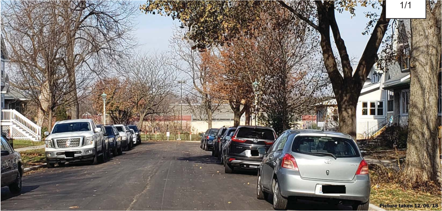
Picture taken 12/06/18