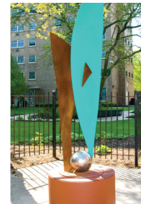
2 First United Church of Oak Park 848 Lake Street (1873/1918, Holmes & Flinn)