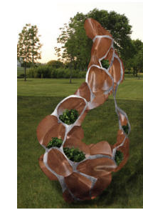
7 Lake & Forest Street Corner (site under development) Lake Street at N. Forest Avenue, NE Corner