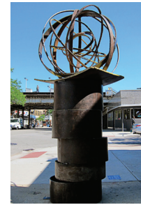
1 Oak Park Public Library 834 Lake Street (2004, Nagle Hartray)