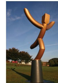
6 Lake & Forest Street Corner (site under development) Lake Street at N. Forest Avenue, NE Corner