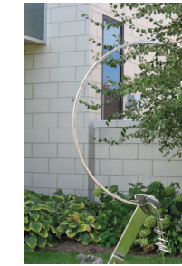
9 The Beachy House 238 N. Forest Avenue (1906, Frank Lloyd Wright)